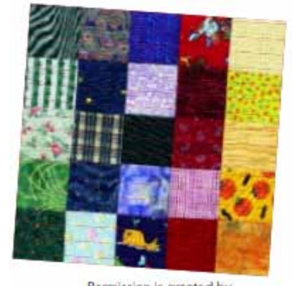
Permission is granted by Love of Quilting to copy these instructions.